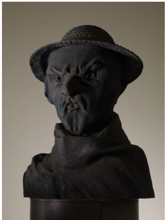
Thomas Schütte Fratelli detail (2012)

Schütte has long made it his policy to sell only a quarter of his artistic output. He says he's earned enough money and wants to make his work available to museums for free—bypassing rich collectors who often demand loan fees from institutions.